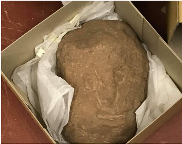
Roman or Celtic Head, Beacon Museum, Whitehaven