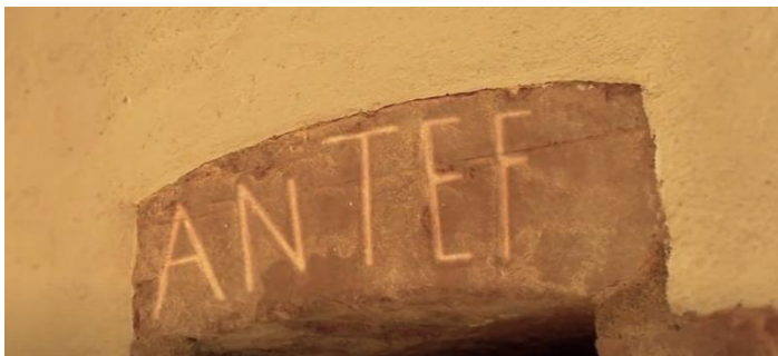
Engraving from Holy Trinity Church, Millom

Within the Holy Trinity Church, v next to Millom Castle, there is a red sandstone slab engraved with ANTEF: